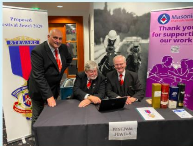
The PGM 'signs up' for Continuous Giving at Provincial Grand Chapter